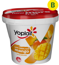
Yoplait Mango 1kg