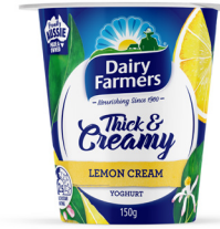
Dairy Farmers Thick & Creamy Lemon Cream 150g