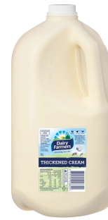
Dairy Farmers Cream Thickened 5L