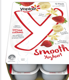
Yoplait Smooth Mixed Favourites 12x100g