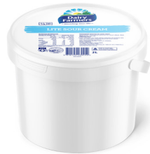
Dairy Farmers Lite Sour Cream 2L