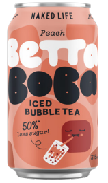
Naked Life Beta Boba Bubble Tea Peach 315ml Can