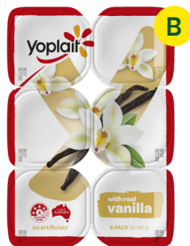
Yoplait Vanilla 6x160g