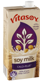
Vitasoy Calci-Plus Soy Milk UHT 1L