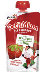
Petit Miam Squeeze Pouch Strawberry 70g