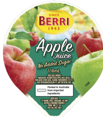
Berri Chilled Juice Apple No Added Sugar Cup 110ml