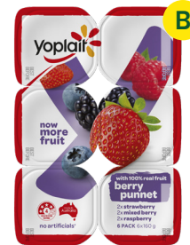
Yoplait Berry Punnet 6x160g