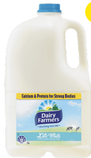
Dairy Farmers Lite White Milk 3L