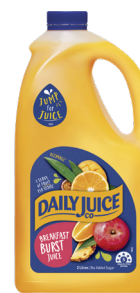
Daily Juice Breakfast AC 2L