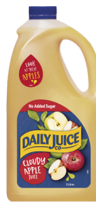
Daily Juice Apple No Added Sugar 2L