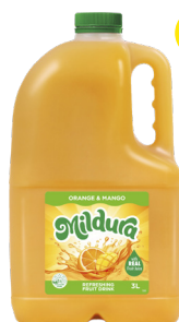
Mildura Chilled Orange Mango 3L