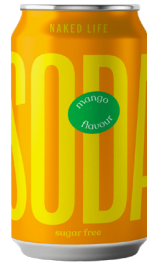
Naked Life Mango 330ml Can