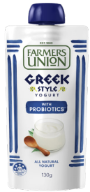
Farmers Union Greek Style Yoghurt Pouch 130g