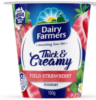
Dairy Farmers Thick & Creamy Strawberry 150g