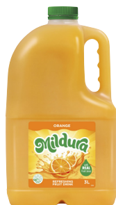
Mildura Chilled Orange 3L