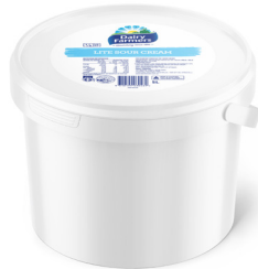
Dairy Farmers Lite Sour Cream 5L