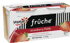
Fruche Strawberry Fields 2x150g