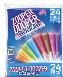
Zooper Dooper Water Ice Cosmic 24x70ml