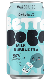
Naked Life Beta Boba Bubble Tea Original 315ml Can