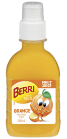
Berri LL Juice Orange No Added Sugar 250ml