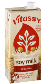
Vitasoy Original Soy Milk UHT 1L