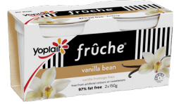
Fruche Vanilla Bean 2x150g