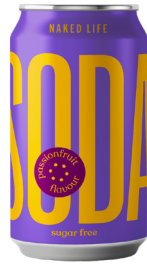
Naked Life Passionfruit 330ml Can