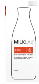
MILKLAB Almond Milk 1L