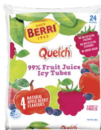
Berri Quelch Juice Mix No Added Sugar Bag 24x70ml