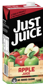
Just Juice Apple No Added Sugar 1L