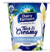
Dairy Farmers Thick & Creamy Vanilla 150g