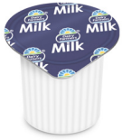
Dairy Farmers Full Cream Milk Portion 240x15ml