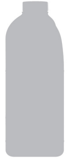
Dairy Choice Crema 2L