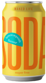
Naked Life Lemon Squash 330ml Can