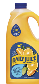
Daily Juice Orange Pulpless No Sugar Added 2L