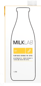
MILKLAB Soy Milk 1L