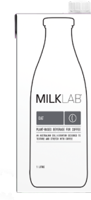
MILKLAB Oat Milk 1L