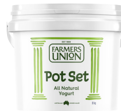
Farmers Union Natural Euro 10kg