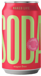
Naked Life Raspberry 330ml Can