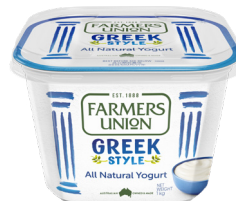
Farmers Union Natural Greek Style Yoghurt 1kg