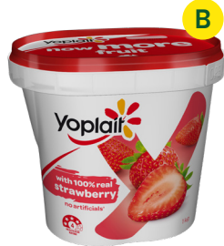
Yoplait Strawberry 1kg