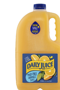
Daily Juice Orange Pulpless No Added Sugar 3L