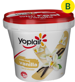
Yoplait Vanilla 1kg