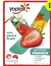
Yoplait Classics 12x100g