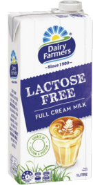
Dairy Farmers Lactose Free 1L