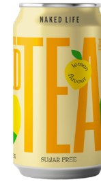
Naked Life Iced Tea Lemon 330ml Can