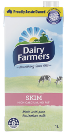
Dairy Farmers UHT Skim Milk 1L