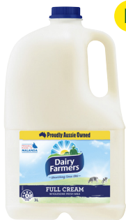
Dairy Farmers Full Cream Milk 3L