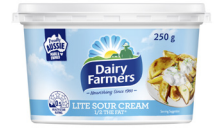
Dairy Farmers Lite Sour Cream 250g