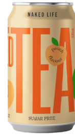
Naked Life Iced Tea Peach 330ml Can