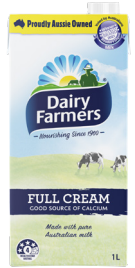
Dairy Farmers UHT Whole Milk 1L