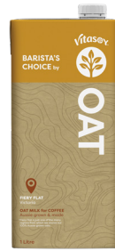
Baristas Choice by Vitasoy Oat Milk UHT 1L