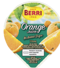
Berri Chilled Juice Orange No Added Sugar Cup 110ml