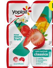
Yoplait Classics 6x160g