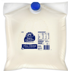
Dairy Farmers Full Cream Juggler 10L