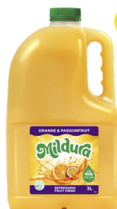
Mildura Chilled Orange Passionfruit 3L