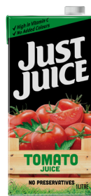
Just Juice Tomato 1L