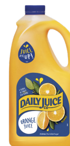
Daily Juice Orange No Added Sugar 2L