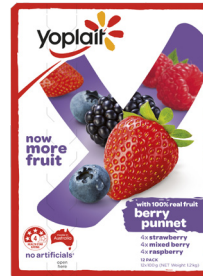
Yoplait Berry Punnet 12x100g