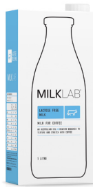
MILKLAB Lactose Free 1L

12 Units | SKU: 3350 TUN: 19315090209324